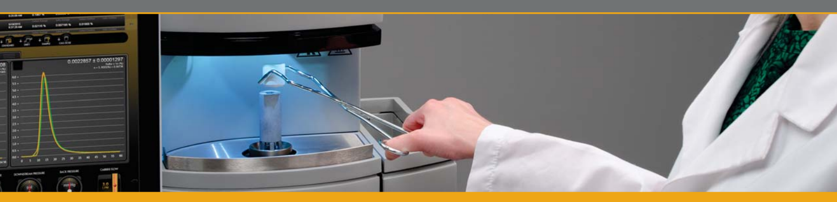
CS844 Series: Carbon/Sulfur by Combustion